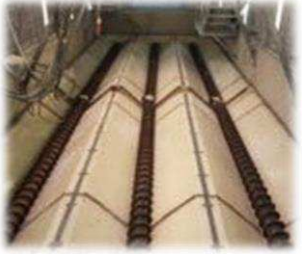
Full Screw Auger Grit Recovery Floor Being Installed