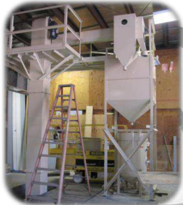
Blast & Recovery System Being Installed in Customer Constructed Enclosure