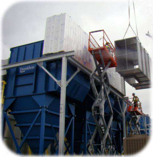
Dust Collection System Installed on Large Abrasive Blasting Cell