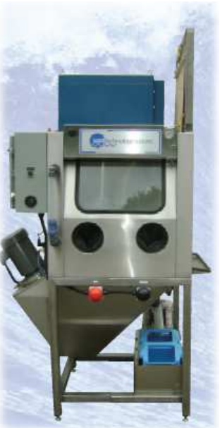
Wet Blasting/ Vapor Honing