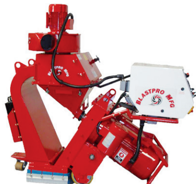
Steel & Concrete Deck Blasters