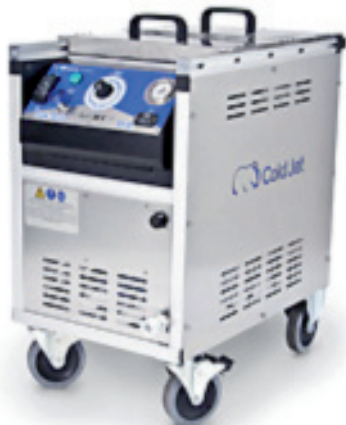
Dry Ice Blasters