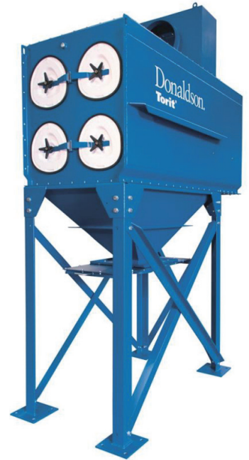
Dust/Mist/ Fume Collectors