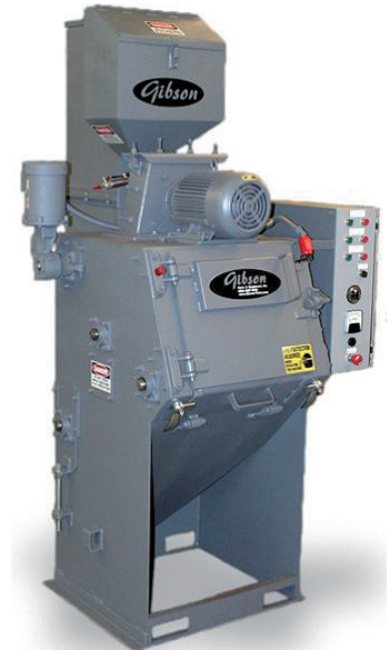
Wheel Blast Equipment