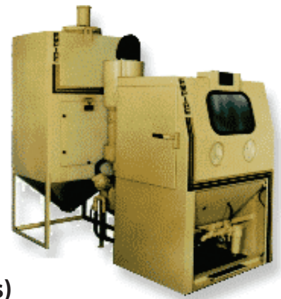
Hand & Automation Sandblast Cabinets