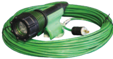
Model 3475-80 [Non Power Box Option] (LED Blast Light, Cable) various cable lengths & plug options available