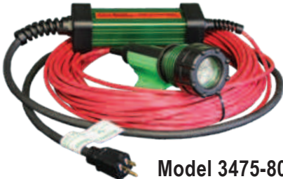
Model 3475-80/S [Complete System Option] (LED Blast Light, Cable, Power Box, & Plug) various cable lengths available