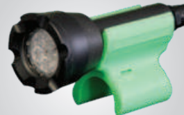
Model 3475-80LW [Light Weight-All Polyurethane Body]