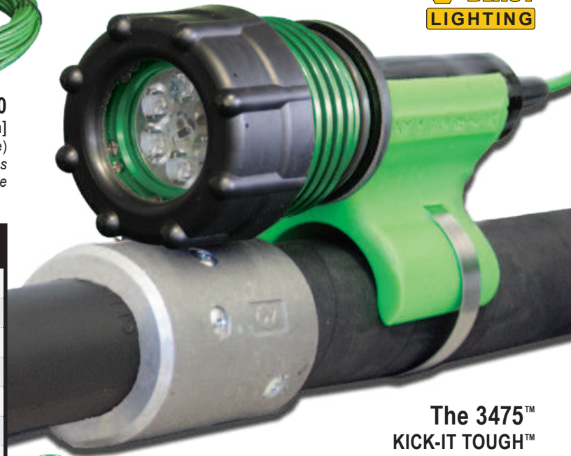
The 3475™ KICK-IT TOUGH™ LED Blast Light (shown w/optional stanchion)