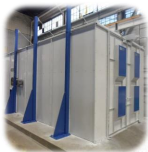
PEB with Custom Roof Slot