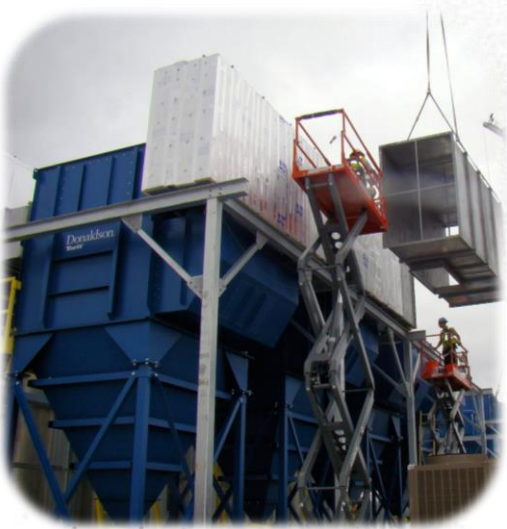
Dust Collection System Installed on Large Abrasive Blasting Cell