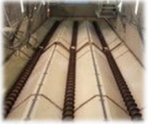
Full Screw Auger Grit Recovery Floor Being Installed