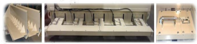
Pneumatic Media Recovery Floor Components