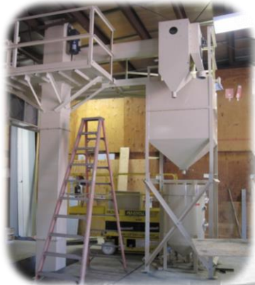
Blast & Recovery System Being Installed in Customer Constructed Enclosure