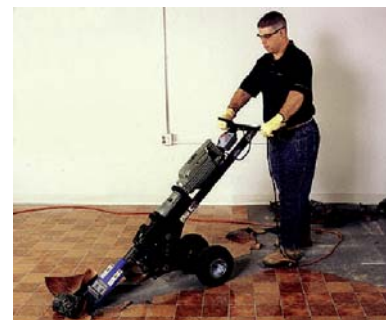
Wide variety of Powered Hand Tools (including Concrete Cutting Saws)