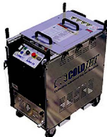
Dry Ice Blasters