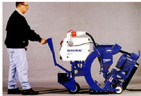
Steel & Concrete Deck Blasters