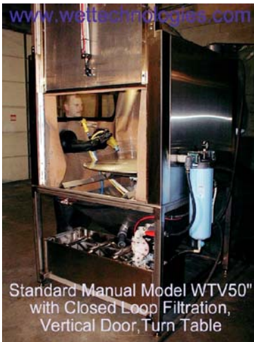
Wet Blasting / Vapor Honing