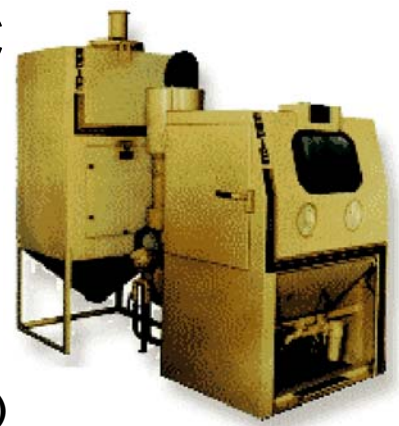
Hand & Automation Sandblast Cabinets